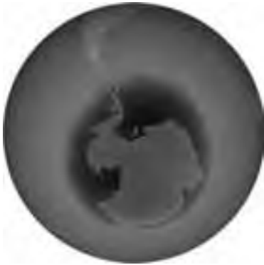
A NASA image of the ozone hole over the Antarctic in September 1987.

If you walk down any street in Canada and ask what the Montreal Protocol is, you'll likely get more blank stares than informed answers. If you ask the same people if they checked the UV Index or applied sunscreen before leaving home that morning, they would very likely reply, yes. Without the Montreal Protocol, that process would probably not be commonplace.