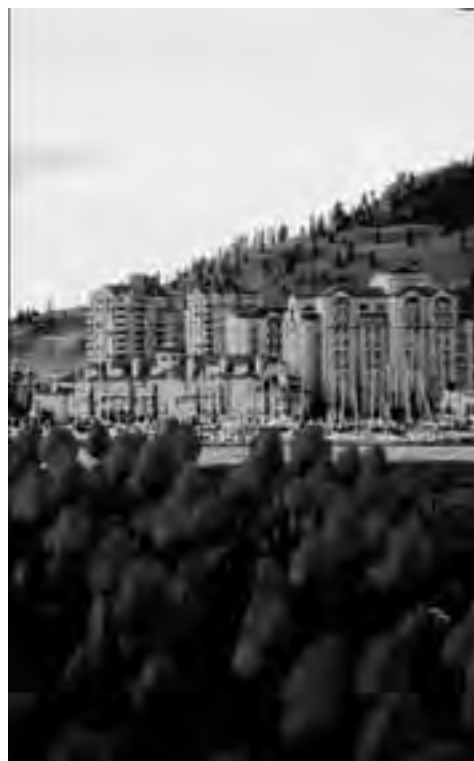
L'hôtel "The Great Okanagan Lakefront & Resort Conference Centre"

42 ième Congrès annuel de la Société canadienne de météorologie et d'océanographie du 25 au 29 mai 2008 à Kelowna, Colombie-Britannique, Canada http://www.cmos2008.ca