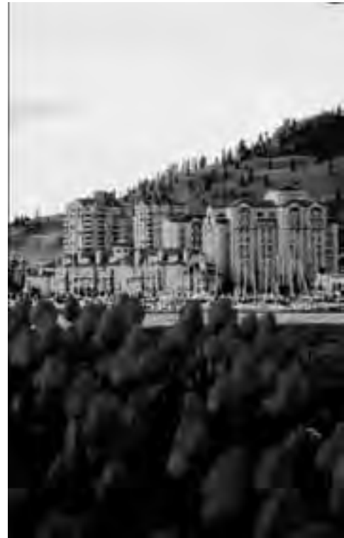
The Great Okanagan Lakefront & Resort Conference Centre

42 nd Annual Canadian Meteorological and Oceanographic Society Congress May 25 to 29, 2008 Kelowna, British Columbia, Canada http://www.cmos2008.ca